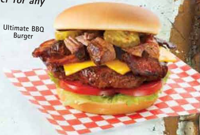
Ultimate BBQ Burger

A meaty burger that's really lean? Now you're talkin' turkey! Premium ground turkey on a toasted bun loaded with lettuce, tomato, red onion and our special BBQ mayo. 8.99