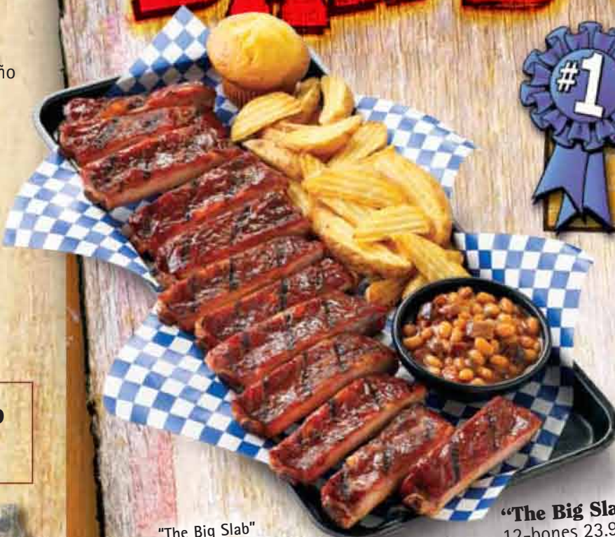
"The Big Slab"