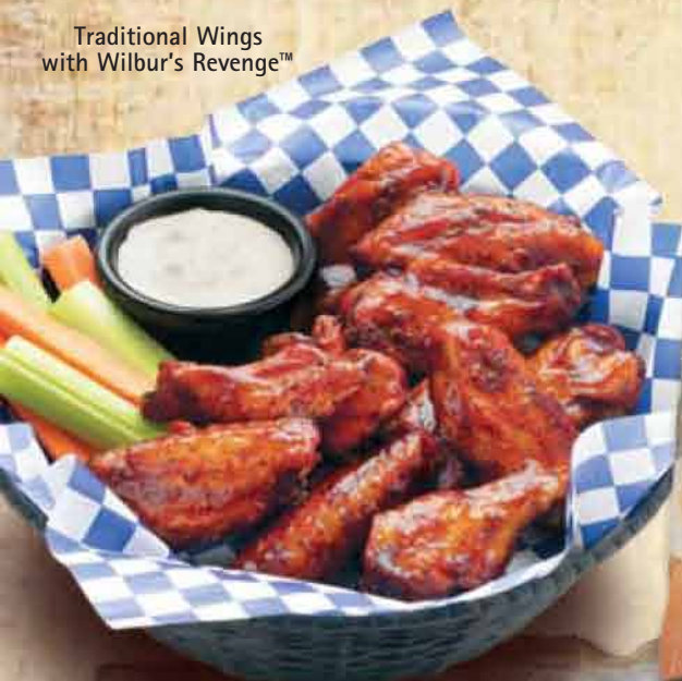
Traditional Wings with Wilbur's Revenge™

No bones about it! These BBQ wings are amazingly meaty all the way through. Tossed in your choice of sauce.