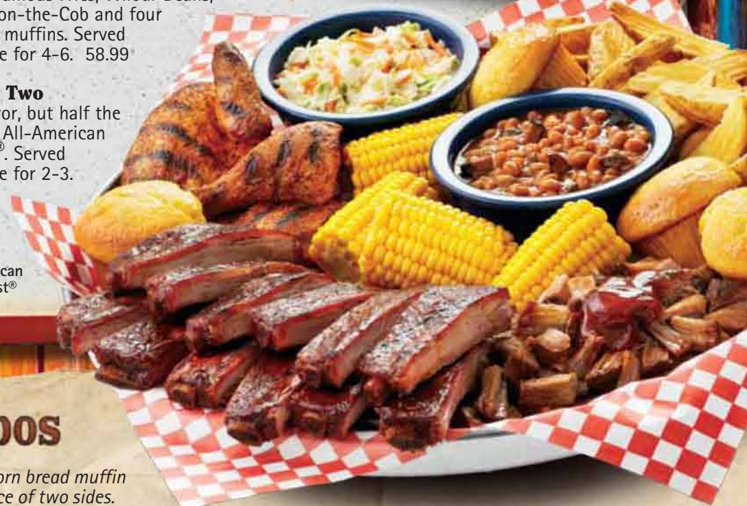
All-American BBQ Feast®

All the flavor, but half the size of our All-American BBQ Feast®. Served family-style for 2-3. 34.99