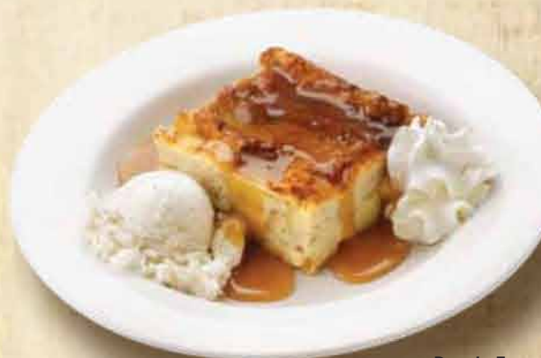
Dave's Famous Bread Pudding