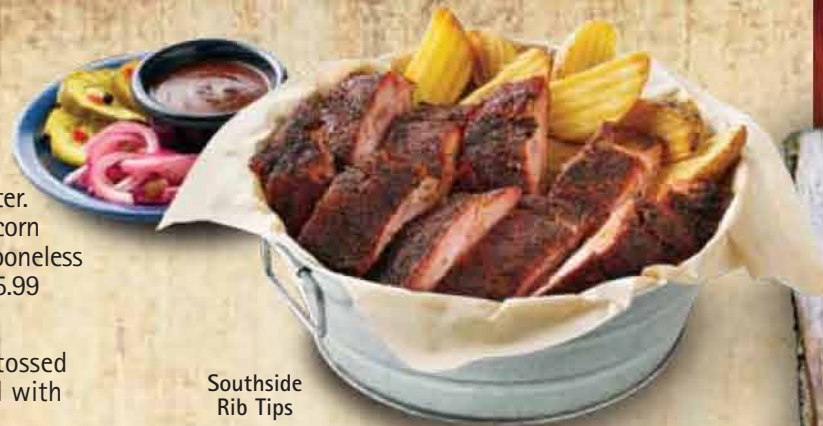
Southside Rib Tips

Our own hickory-smoked salmon, cream cheese, capers and chipotle peppers makes this a spread worth swimming upstream for. Served with fire-grilled flatbread. 8.99