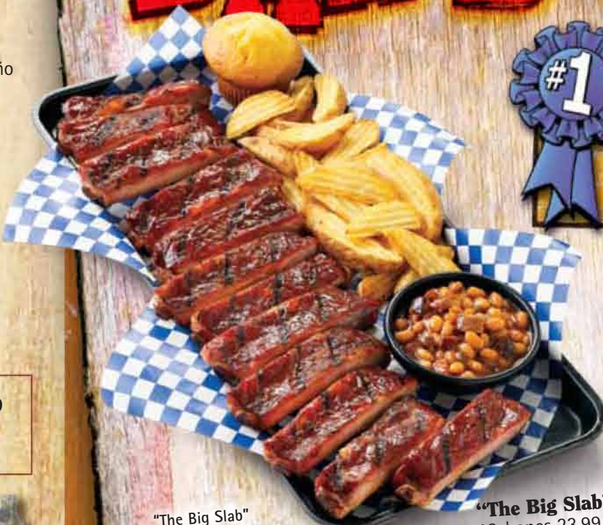
"The Big Slab"