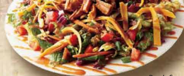
Dave's Sassy BBQ Salad

Save room for one of Dave's after dinner minis. Choose Famous Bread Pudding, Kahlúa Brownie or Strawberry Shortcake, each served with vanilla bean ice cream and whipped cream. 2.49