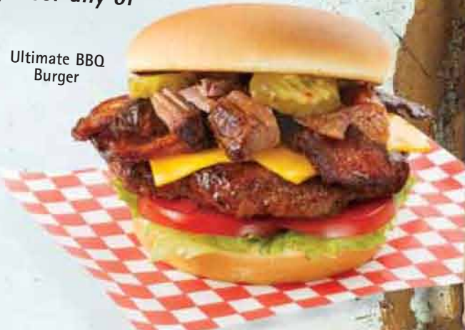
Ultimate BBQ Burger

A meaty burger that's really lean? Now you're talkin' turkey! Premium ground turkey on a toasted bun loaded with lettuce, tomato, red onion and our special BBQ mayo. 8.99